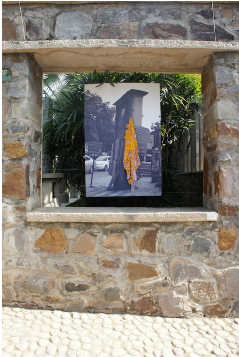
Ayesha Singh, Micked Colonial Structure & Micked Weave , Digital print on board with woven cloth, 2013