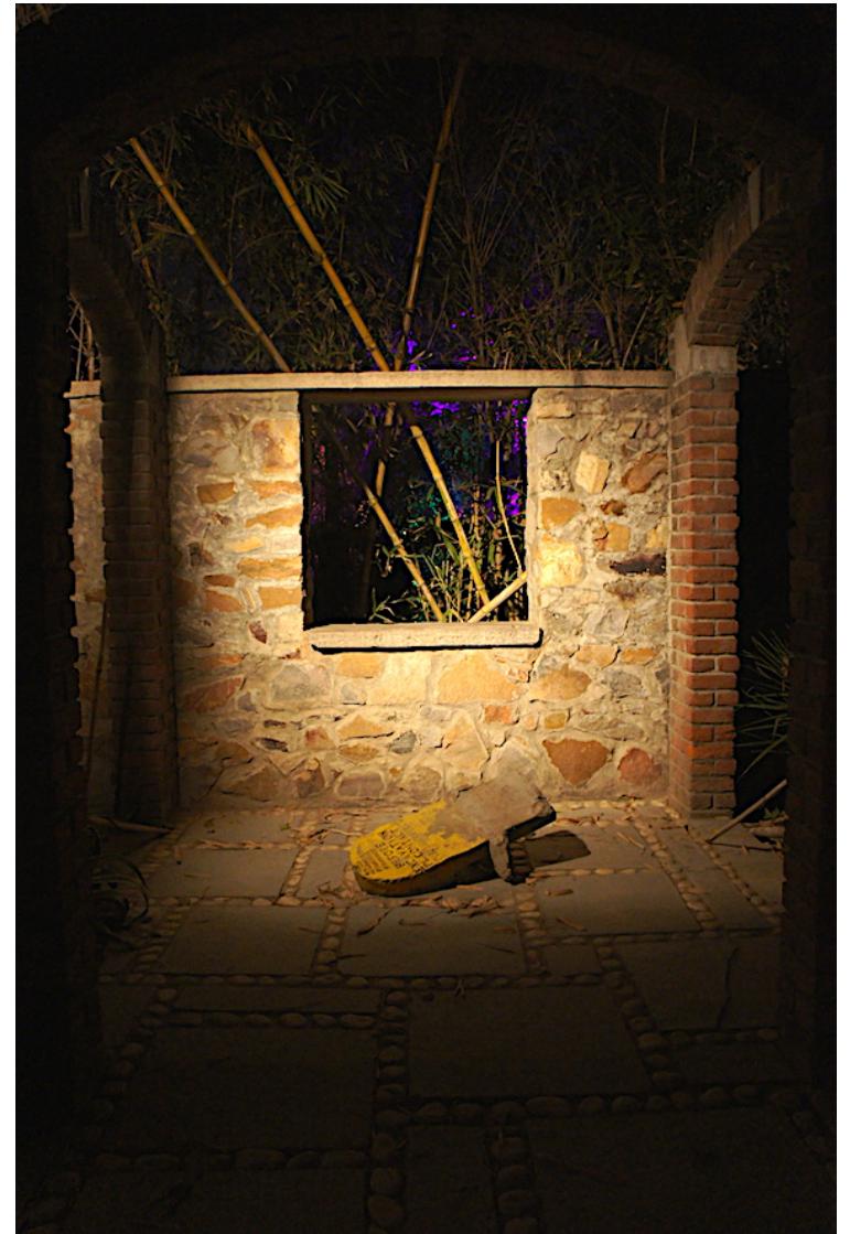
Achia Anzi, Before, After & Meanwhile , 2015