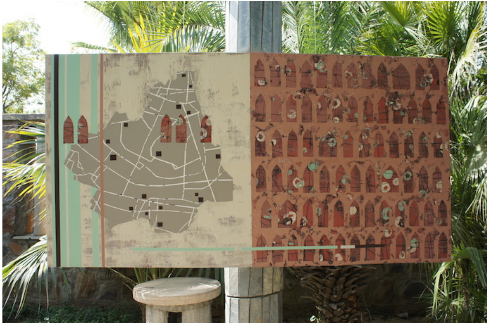
Shalina Vichitra, Delhi , Acrylic & charcoal on canvas, 2013