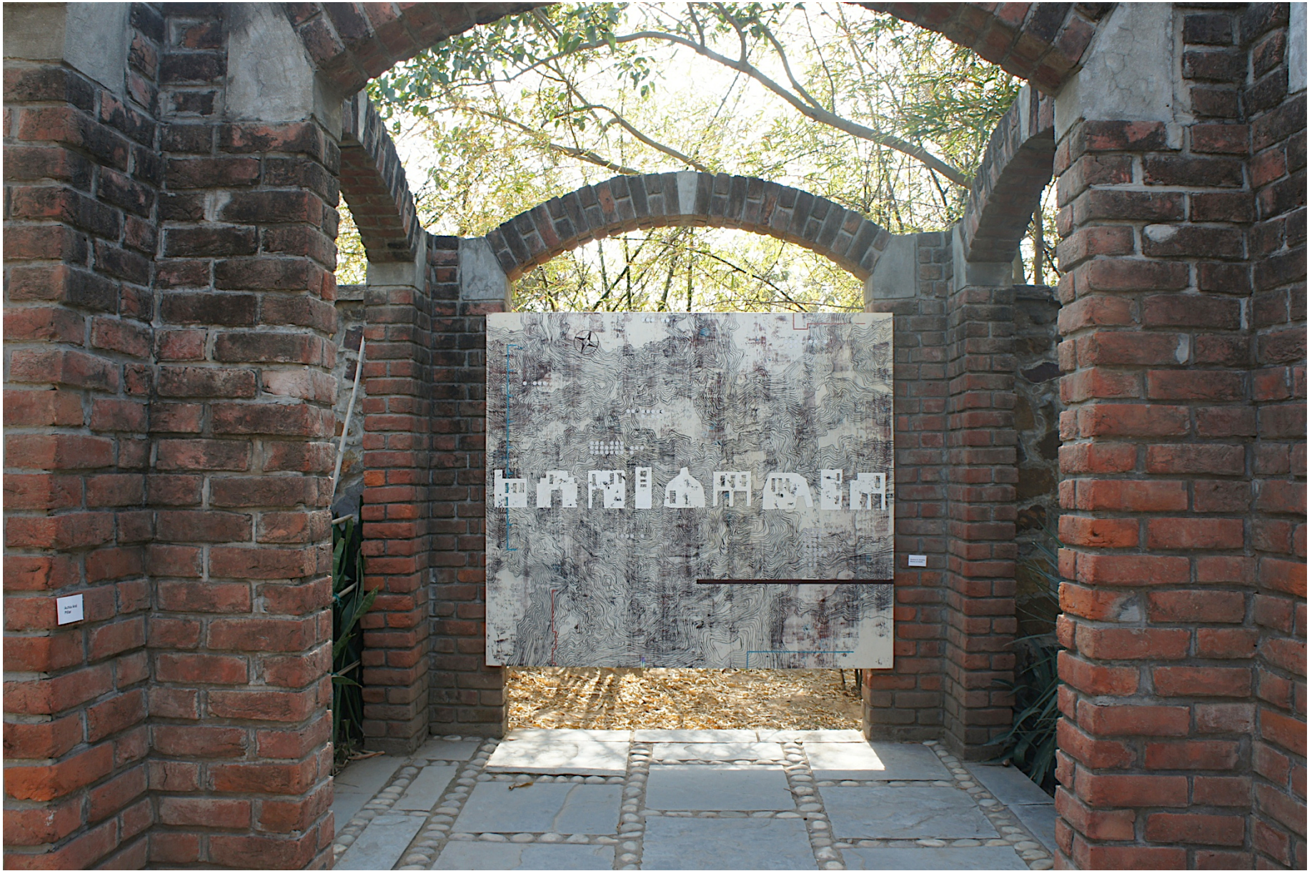
Shalina Vichitra, Where on Earth , Acrylic & charcoal on canvas, 2011