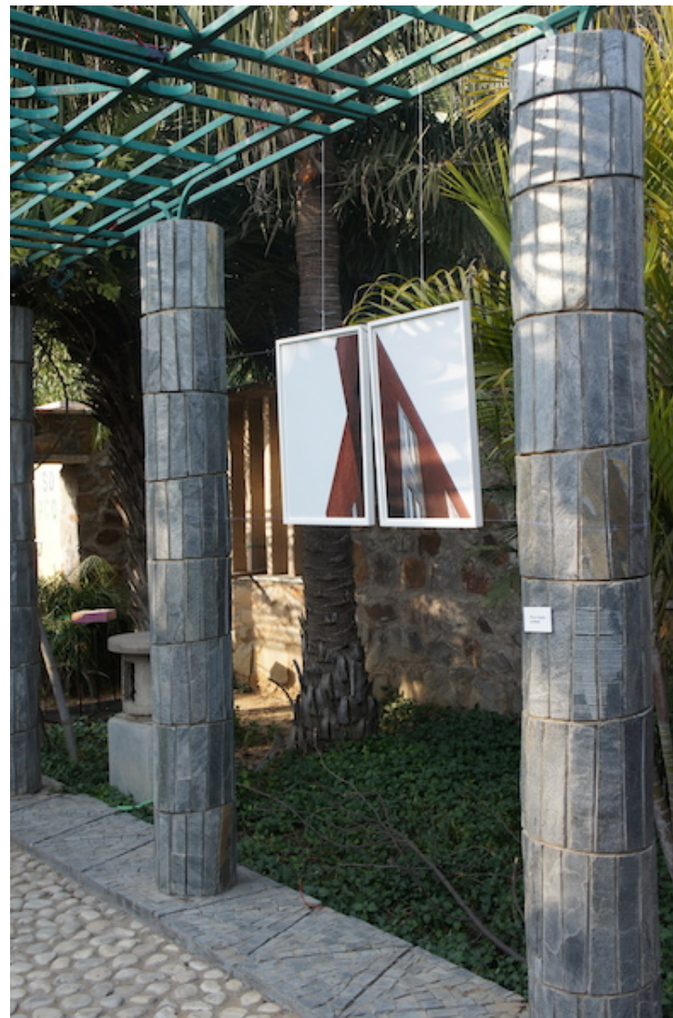
(L-R): Reyaz Badaruddin, Changing Landscape , Ceramic, 2014; Parul Gupta, Untitled , Digital photograph on archival paper, 2012