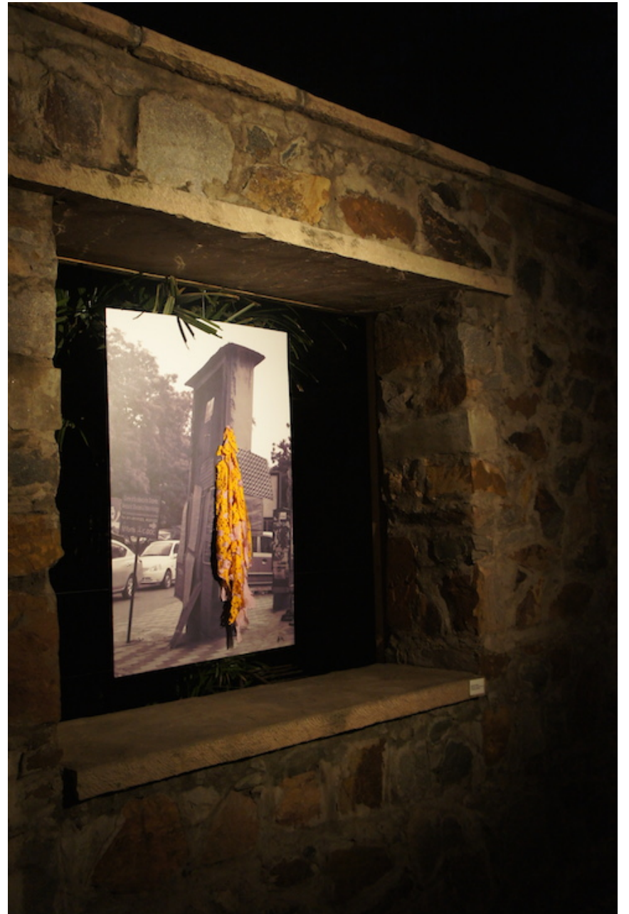
Ayesha Singh, Micked Colonial Structure & Micked Weave , Digital print on board with woven cloth, 2013