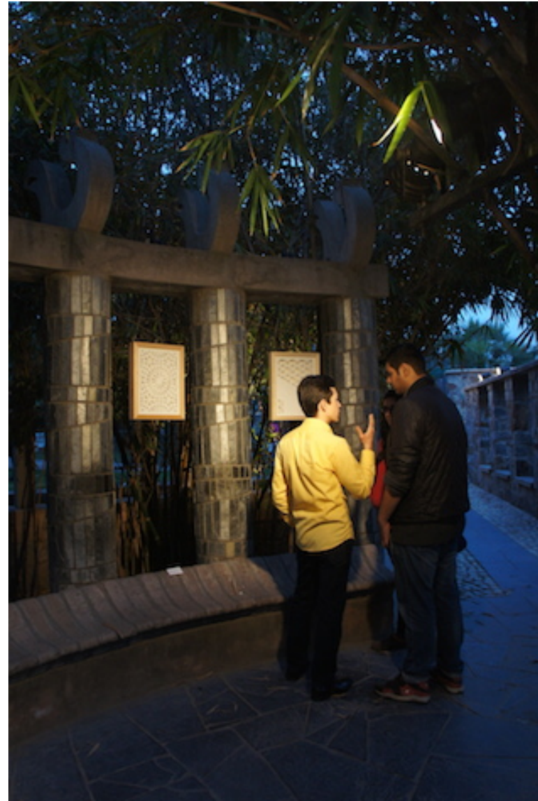
Installation view at night