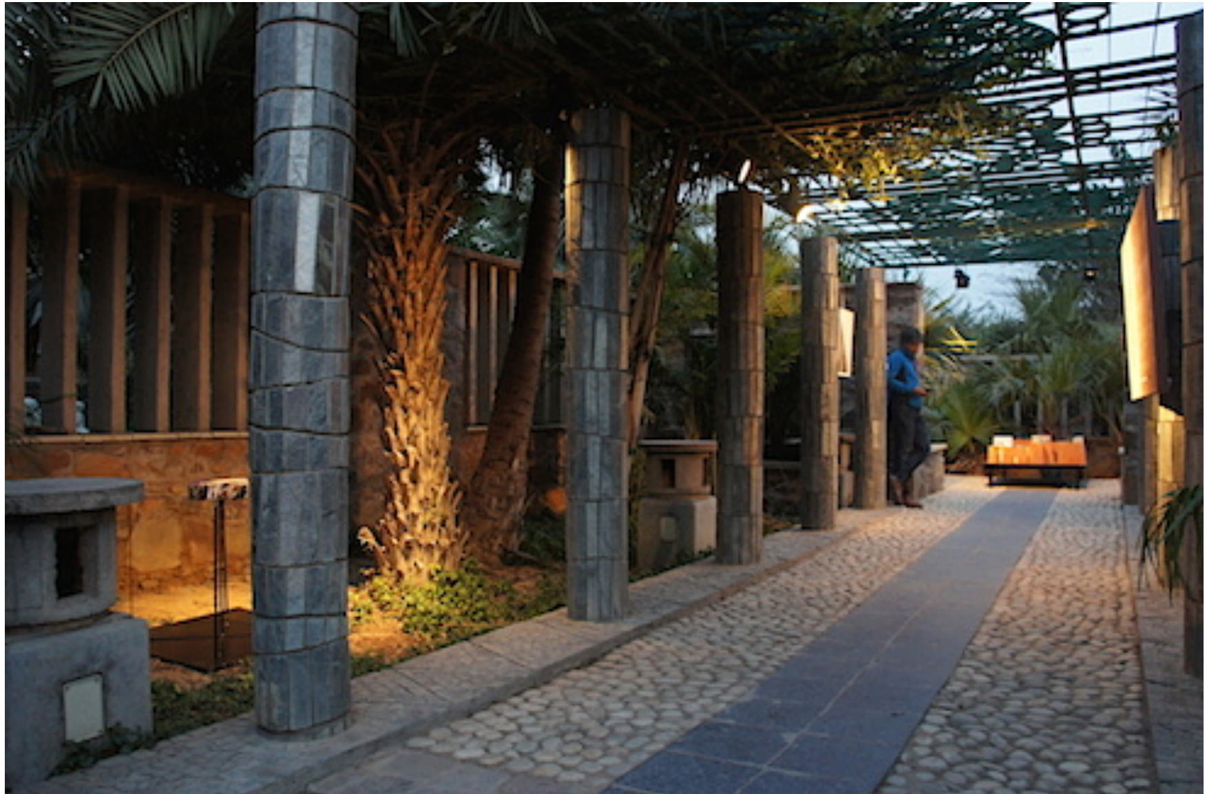
Installation view at sunset