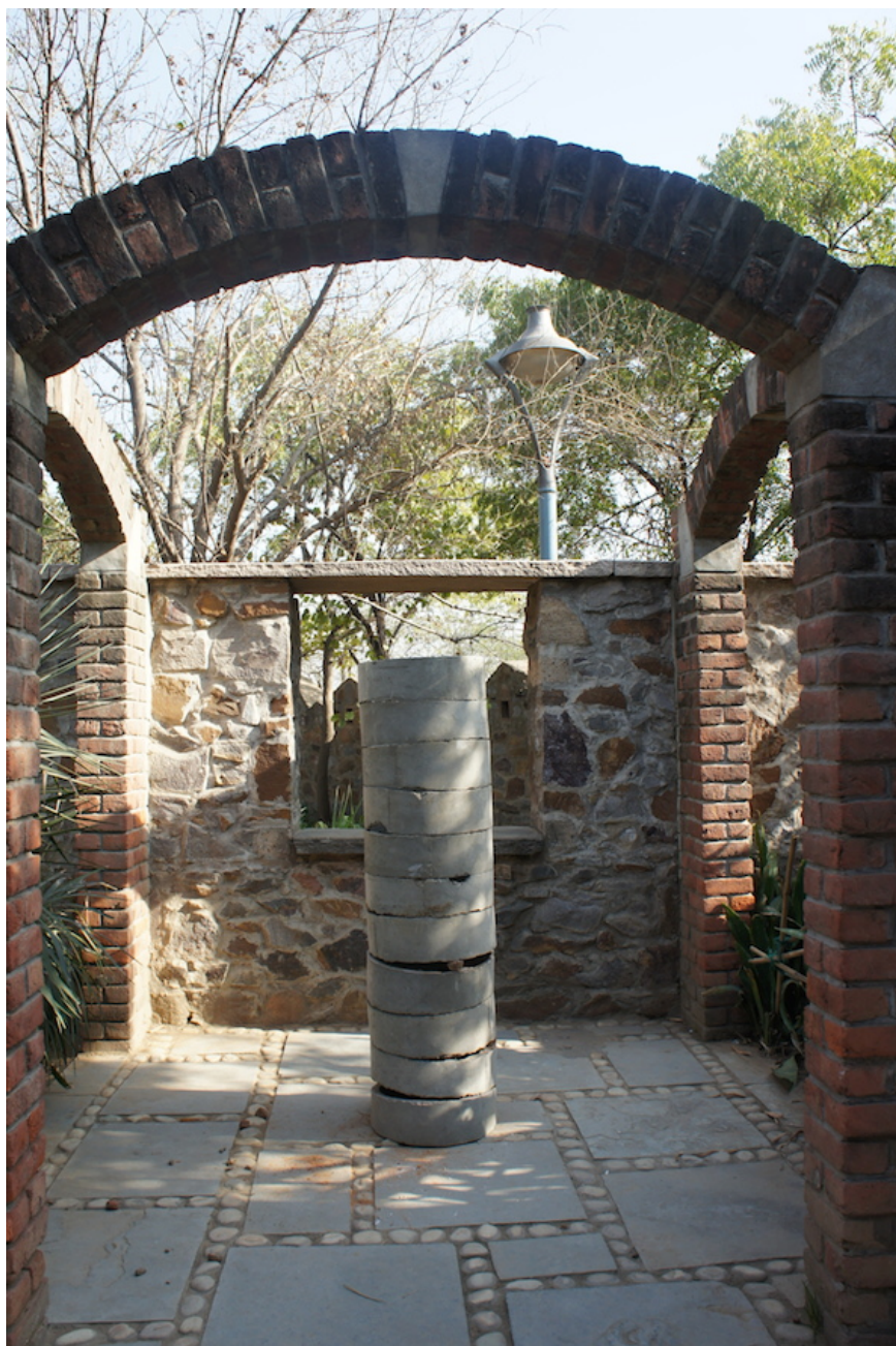
Achia Anzi, Pillar , 2014