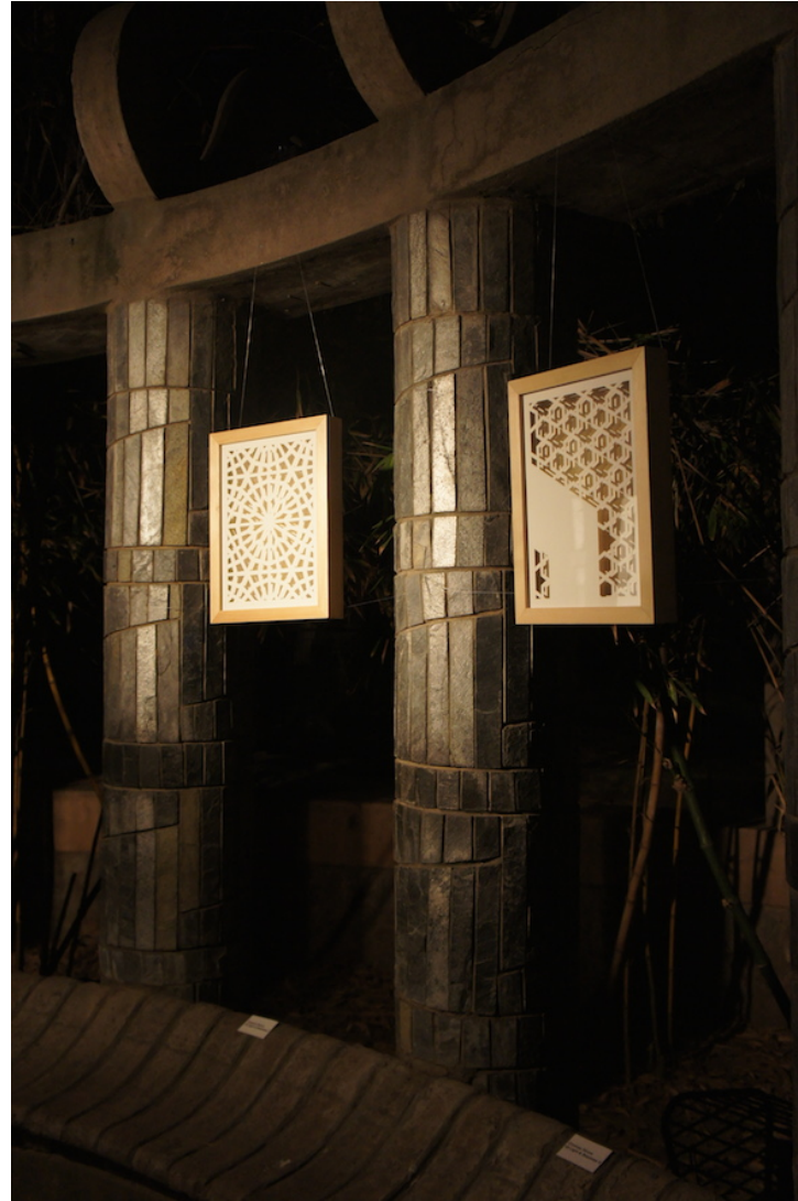
Chetnaa Verma, Of Shadows & Light I & II , Paper collage, (2015)