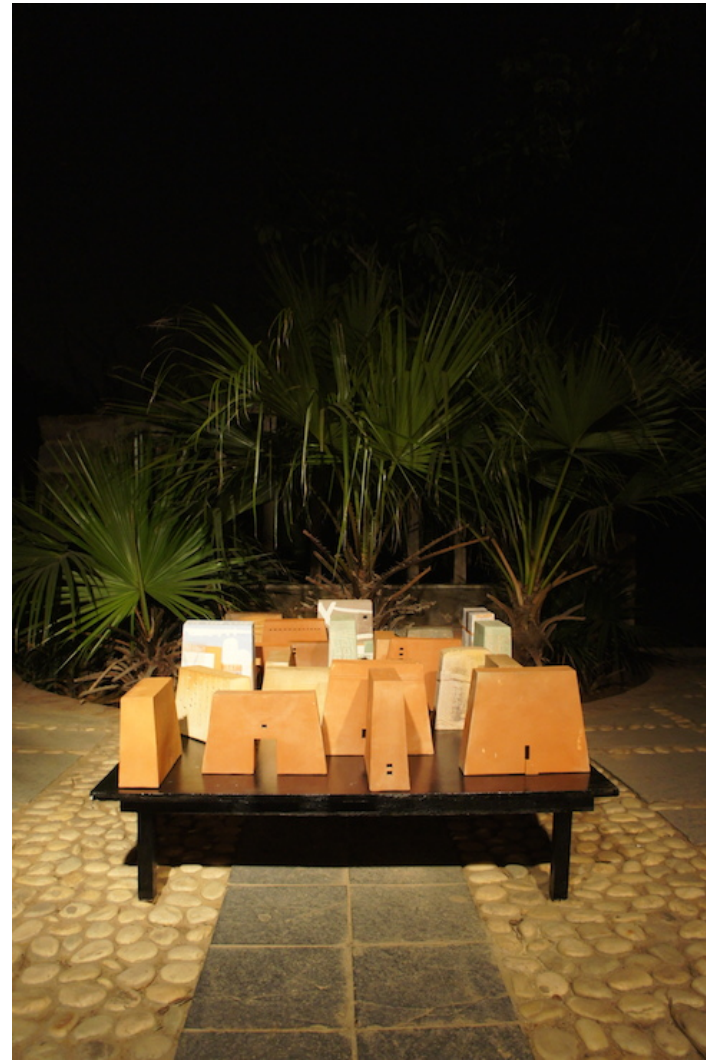
Reyaz Badaruddin, Changing Landscape , Ceramic, 2014