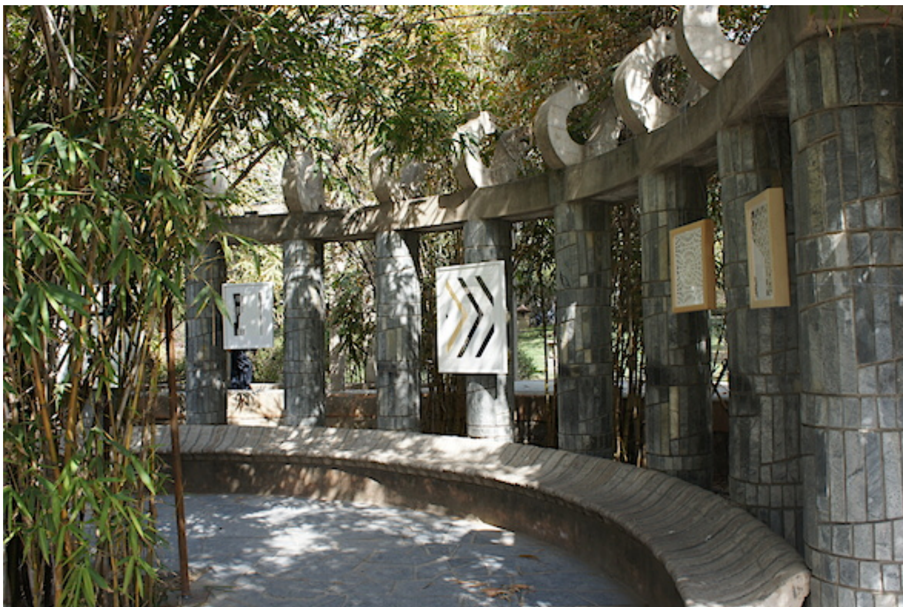
Installation view (L to R): Chetnaa Verma, Linear Polarity , 2012, Crossways of Diagonals , 2014, Of Shadows & Light I & II 2015