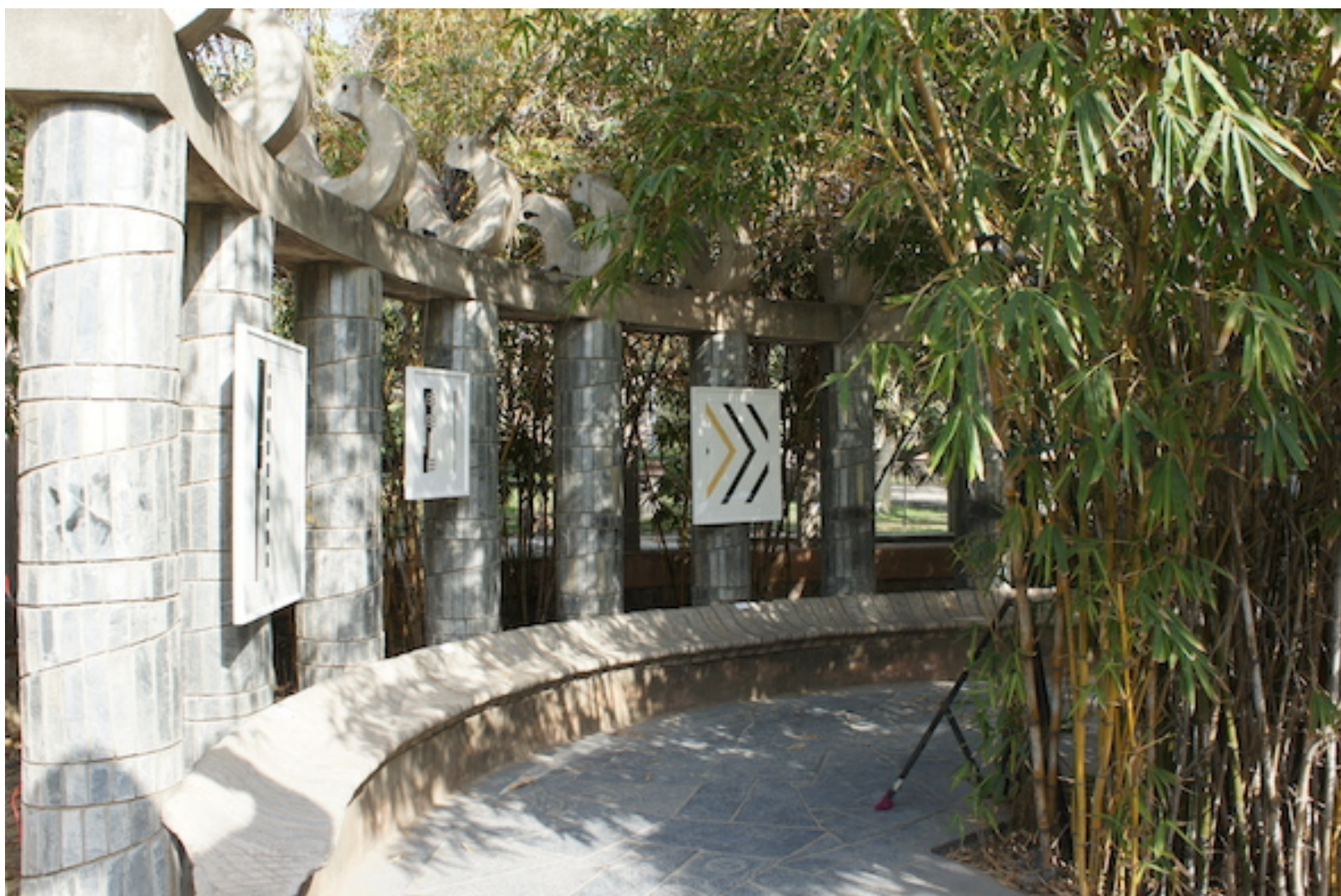
Installation view of line drawings (Pen and ink on paper) by Chetnaa Verma (L to R): Straight, Diagonal, Horizontal & Vertical V , 2012, Linear Polarity (2012), Crossways of Diagonals , 2014