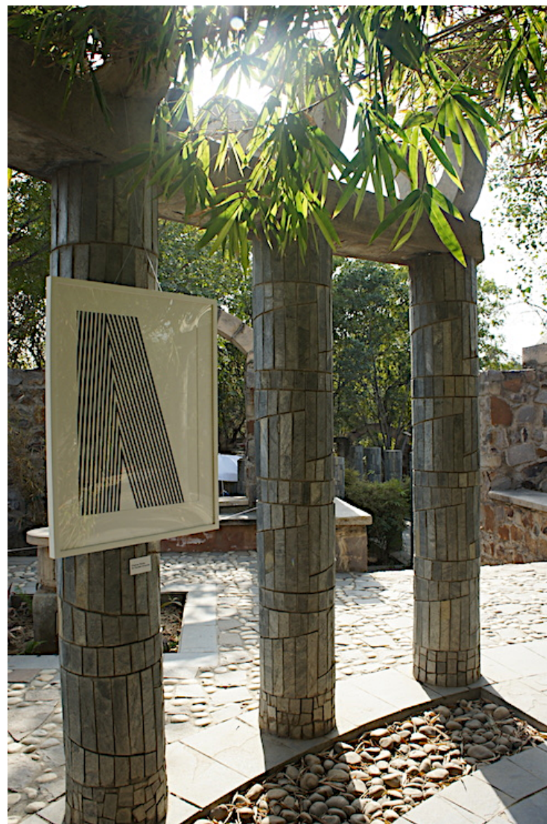
(L) Entrance to the gallery, (R) Chetnaa Verma, On Parallel Grounds (2014)